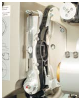
Curved film gate