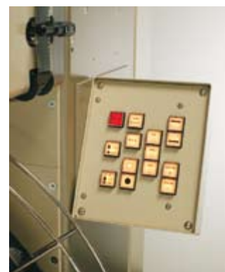
Additional operating panel