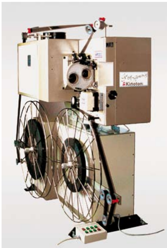
FP 25 D with Sidewinder

For more information visit our website: www.kinoton.com